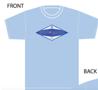
Diamond - Distressed Canvas Light Blue