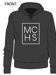
MC HS Hoodie Gray Gildan Dark Heather Gray

Hoodies are pre-order only. Forms will be available at schedule pick-up.