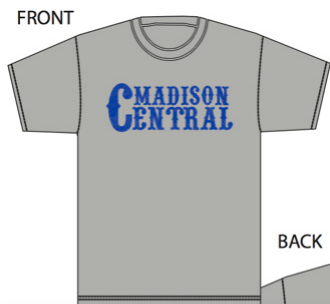
Madison Central - Distressed Canvas Ash (lighter than pictured)