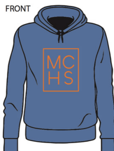
MC HS Hoodie Blue Gildan Heather Sport Royal

Hoodies are pre-order only. Forms will be available at schedule pick-up.